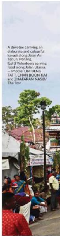
A devotee carrying an elaborate and colourful kavali along Jalan Air Terjun, Penang. (Left) Volunteers serving food along Jalan Utama.